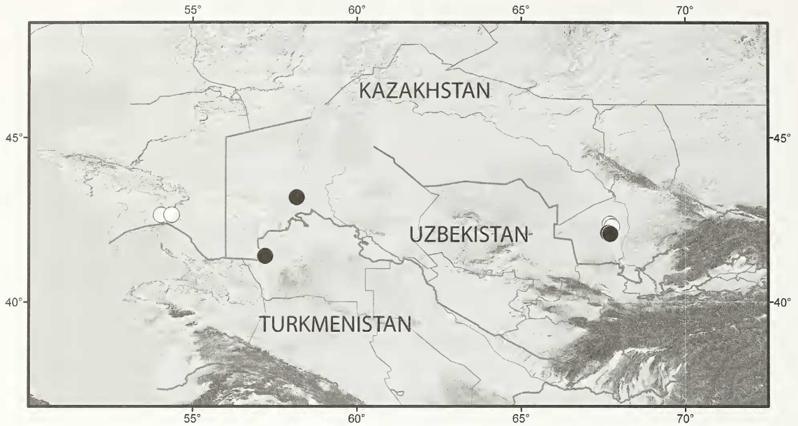
Fig. 6: Collection localities of Oculicosa supermirabilis Zyzun, 1993. Closed dots – original data), open dots – literature-derived data.

kent, Shymkent] Area, Otrar Distr., Kyzylkum Desert, N foothills of Karaktau [=Kairaktau] Hills, c. 43.8 km NW of Bairkum, nr. Tabakbulak (42°21'26.7"N, 67°41'56.3"E), clayey soil, c. 225 m. a.s.l., 23-25.05.1993, A. A. Zyzun leg. – (3) Kazakhstan, South Kazakhstan [=Chimkent, Shymkent] Area, Arys' Distr., Kyzylkum Desert, c. 35.2 km NW of Bairkum, Karaktau [=Kairaktau] Hills, Karamola Mt., top part (42°16'48.4"N, 67°45'28.7"E), c. 376 m. a.s.l., 29-31.05.1993, A. A. Zyzun leg.